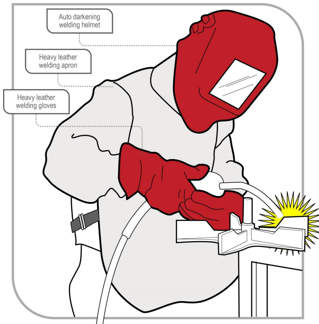
Figure 3 Worker wearing PPE while welding

When PPE is worn by workers, it should not introduce other hazards to the worker, such as musculoskeletal injuries, thermal discomfort, or reduced visual and hearing capacity.