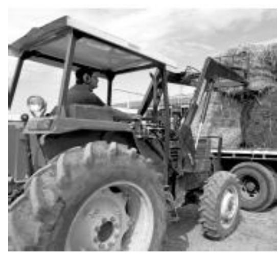
Figure 4. Tractor fitted with a FEL, specifically designed for loading/unloading hay bales.

FELs should be supplied with a support stand which places the arms at the correct height to allow the tractor to be driven in or out when connecting or disconnecting the arms. The support stand should be located on a firm level surface capable of supporting the weight of the unhitched FEL.