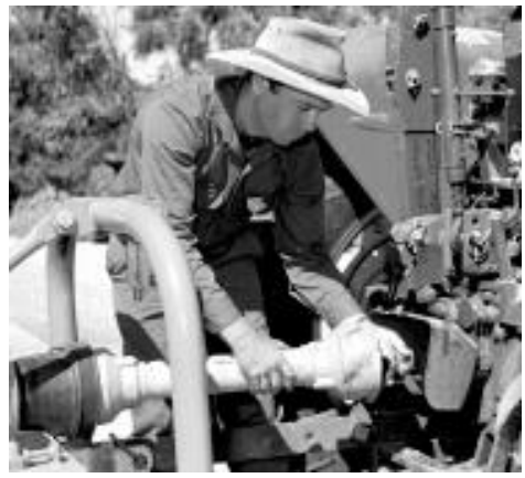
Figure 1. Tractor being fitted with PTO guard.