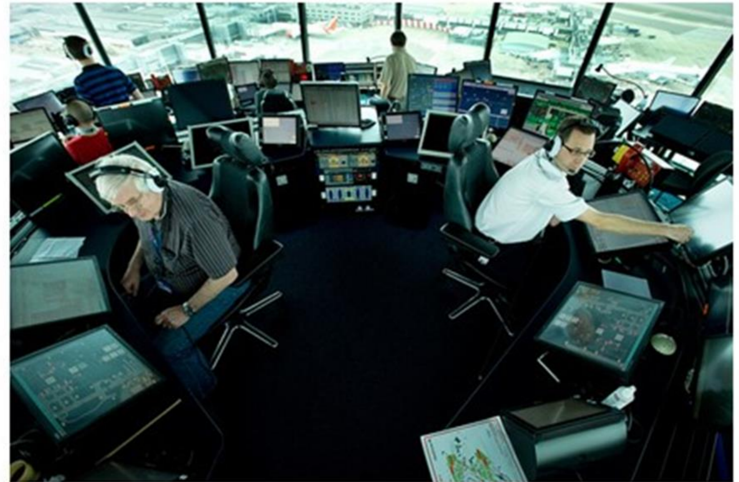
Air Traffic Control Tower